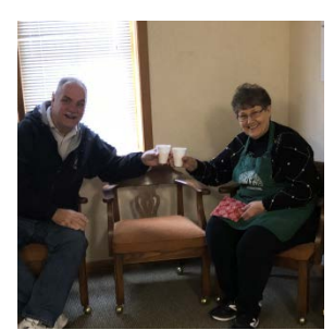
More holiday photos can be found on page 3.