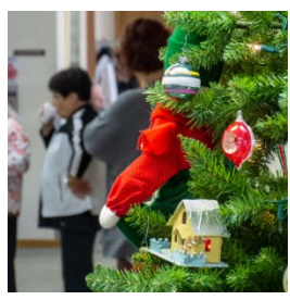
Christmas Open House